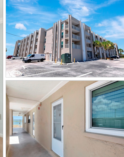
View Online: http://www.pfretour.com/32016